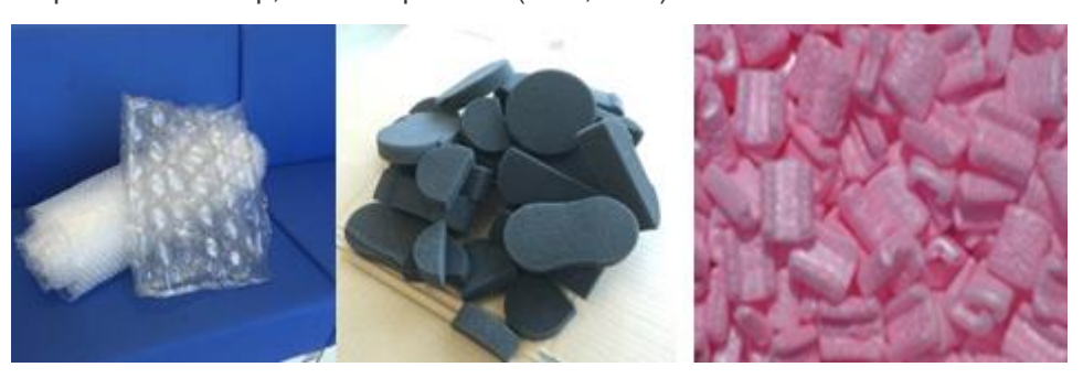
Did you know? Recommended thickness of buffering material:

Example: Bubble wrap, loose fill peanuts (EPE, EPS)